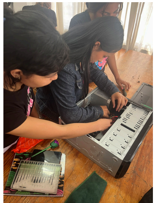
A few years ago, students at Reyes Irene Valenzuela specifically requested a computer repair course so they could develop a career that would pay salary and benefits. The school now has a classroom dedicated to computer repair, which has evolved into a Microsoft-certified training site.