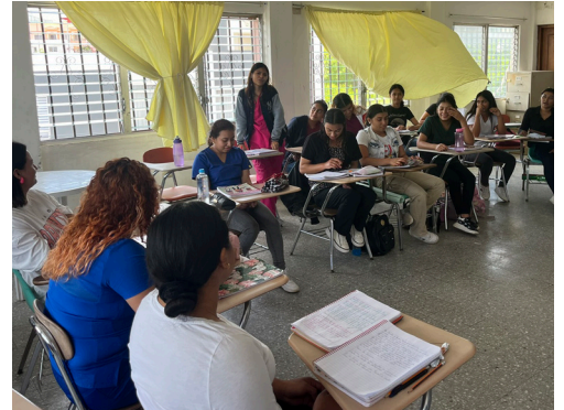
Classes at SAN's Reyes Irene Valenzuela School for Women take place on weekends to accommodate young women who are employed as domestic workers during the week. They receive homework and accessible education through radio while they work.